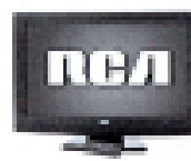
32" Flat Screen TV (Manufacturer may vary)