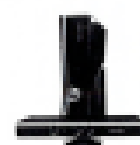
x-Box Console w/ Kinect